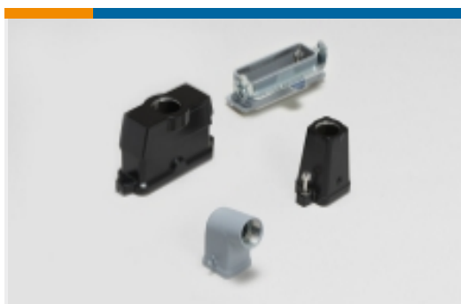
Rectangular Connector Hoods & Bases (1258)